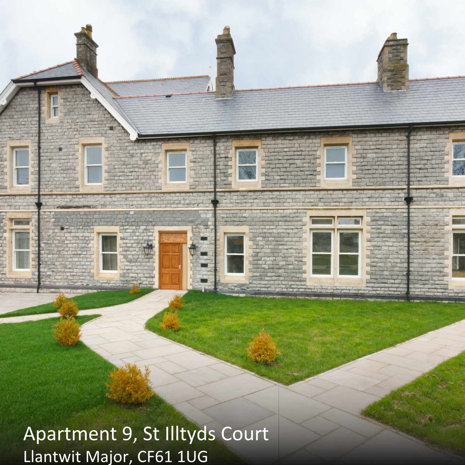
Apartment 9, St Illtyds Court Llantwit Major, CF61 1UG